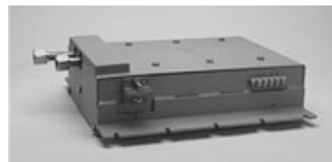
TYPICAL WATER-COOLED MODEL