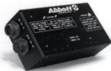
TYPICAL FORCED-AIR COOLED MODEL

Abbott Technologies offers two standard types of harmonically corrected transformer rectifier units: